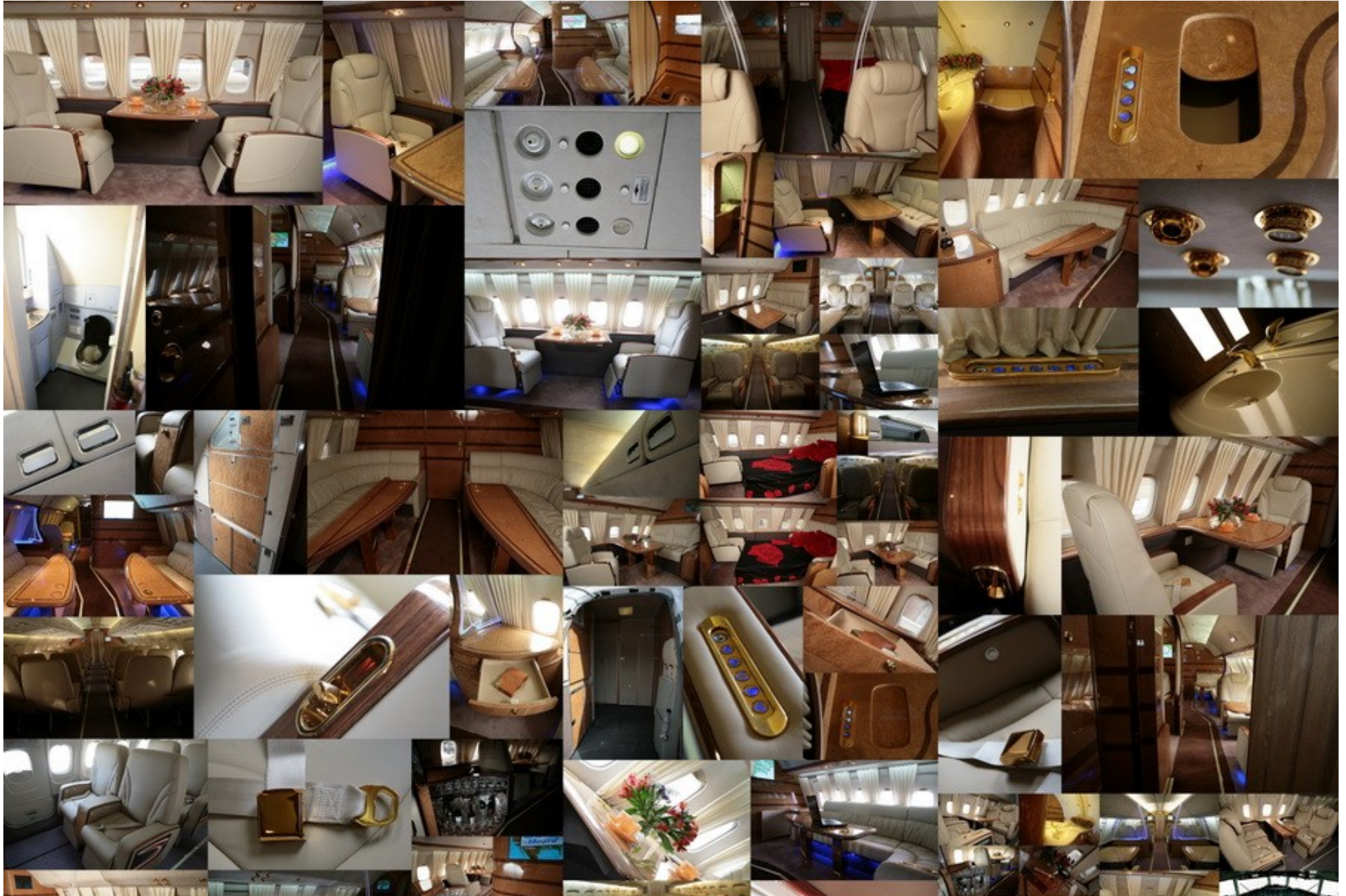
Specification subject to verification upon inspection. Aircraft offered subject to prior sale/lease or withdrawal from the market